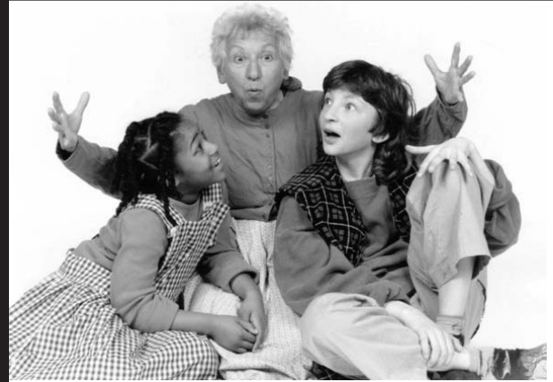
Stagebridge Senior Theatre

Emerson Suites, Phillips Hall, Ithaca College