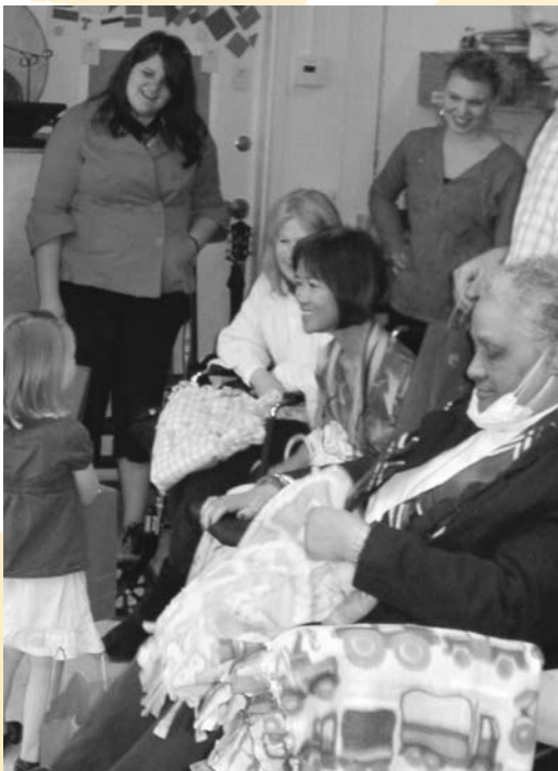
Children from the Head Start program receive blankets made by students from the School of Health Sciences and Human Performance and participants in the Ithaca College Center for Life Skills.