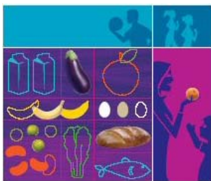
Dietary Guidelines for Americans 2005