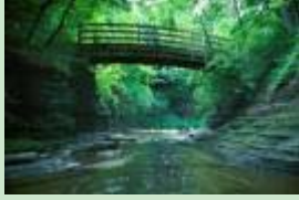
Ithaca in the Spring