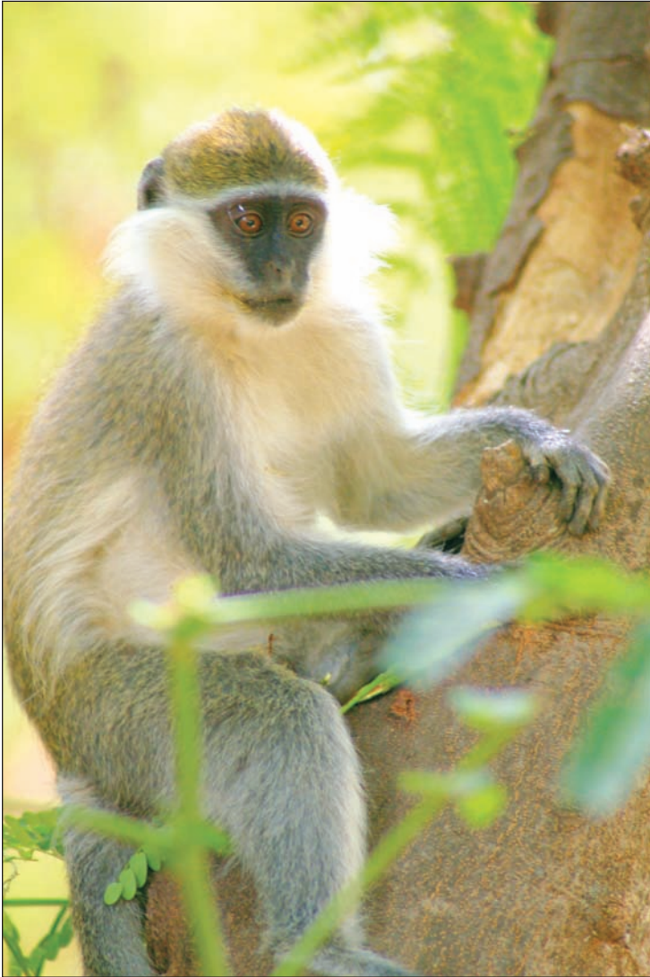
Above: A black-faced vervet monkey watches visitors eat at the Sodore Resort, a popular vacation spot outside the capital city of Addis Ababa. Right: The Park Scholars spent much of their trip in Addis Ababa, a city with a population of four million.