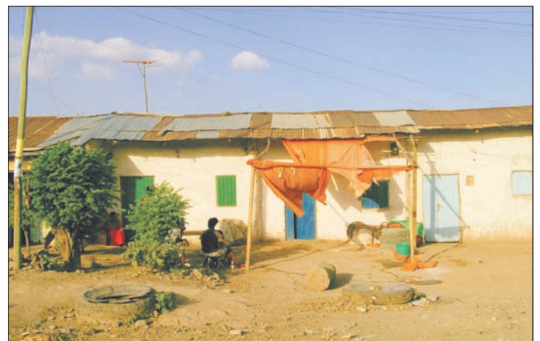
Left: The government recently installed plasma screen televisions in all high school classrooms in Addis Ababa. Lessons are produced in South Africa, Canada and Ethiopia and are then broadcast to the students. The government uses this method to standardize the educational content in schools and to compensate for the shortage of skilled teachers. Above: The Park Scholars visited with Ethiopian children at their homes in the Addis Ababa suburbs.