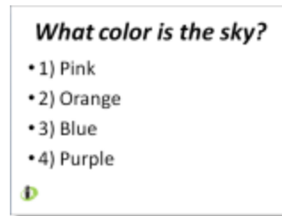
Slide created using PowerPoint along with Response Add-In

5. Your finished slides should have the Interwrite icon in the bottom left corner like the example to the left.