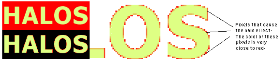
Figure 5. "Halo" caused by anti-aliasing.

In Figure 5, the original image (top left) was created with a red background. The destination web page has a black background. Placing the transparent GIF image on that web page (bottom left) leaves a halo of reddish pixels. These are the pixels that were used to blend the foreground and background colors of my original image.