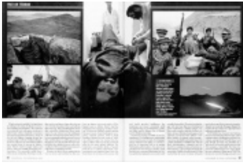
NOVEMBER 12, 2001 "At the Front"