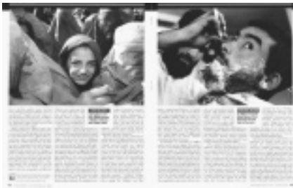
NOVEMBER 26, 2001 "Into the Light," "Newfound Freedom"