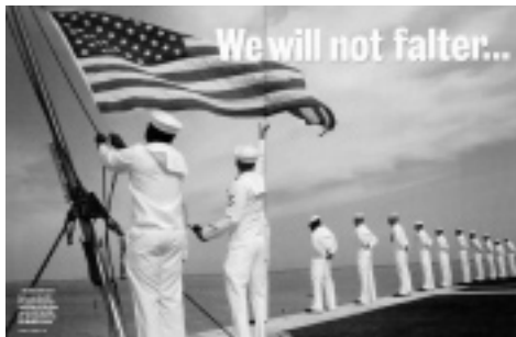
OCTOBER 1, 2001 "We will not falter.."