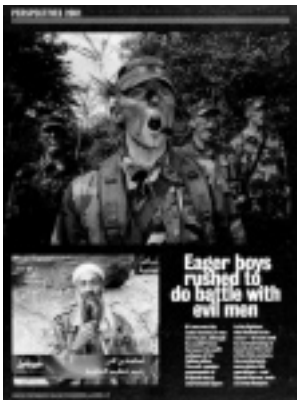
DECEMBER 24, 2001 "Eager boys rushed to do battle with evil men"

QUESTION What messages about the war are communicated? What is your evidence?