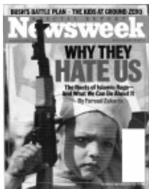
OCTOBER 15, 2001 “Why They Hate Us”