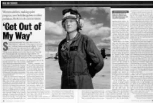
OCTOBER 29, 2001 "Get Out of My Way"