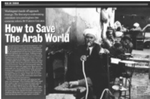
DECEMBER 24, 2001 "How to Save the Arab World"