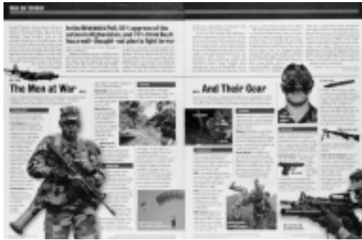
OCTOBER 29, 2001 "The Men at War... And Their Gear"