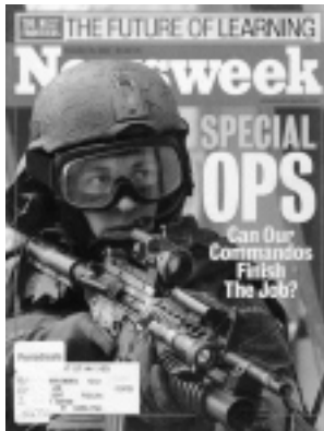
OCTOBER 29, 2001 “Special Ops”