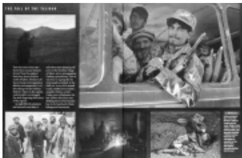
NOVEMBER 26, 2001 "The Fall of the Taliban"