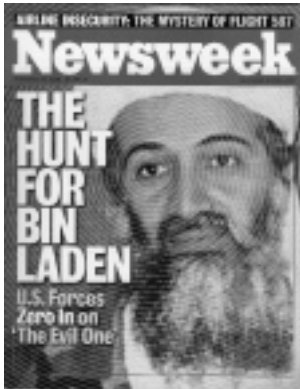
NOVEMBER 26, 2001 "The Hunt for bin Laden"

QUESTION What messages about the war are communicated here? What is your evidence?