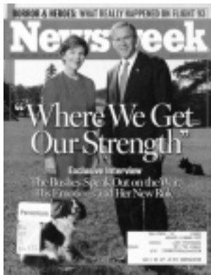
DECEMBER 3, 2001 "Where We Get Our Strength"