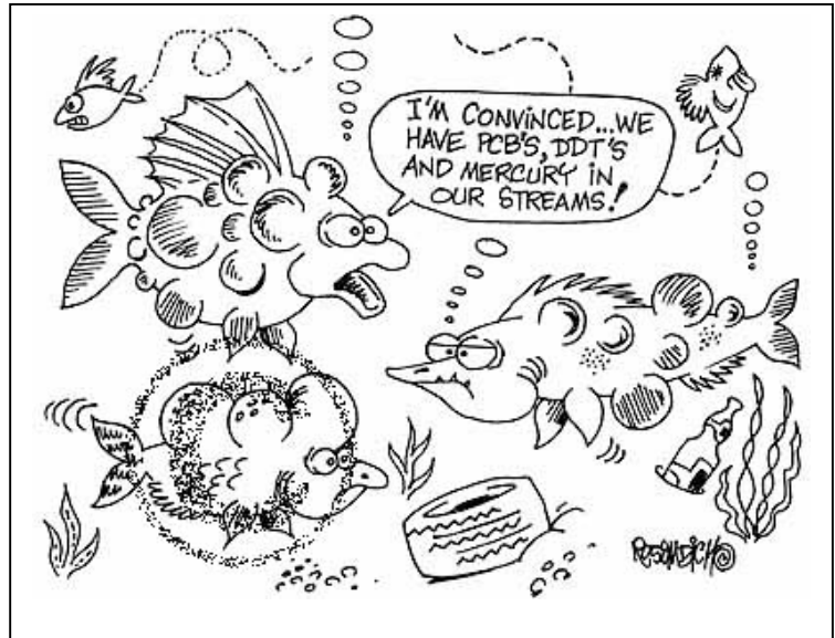
Document #6: 2001 Cartoon by Cox & Forkum