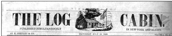
1840: Whig Party Newspaper Banner