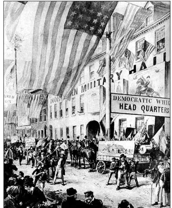
1840: Whig Party Parade