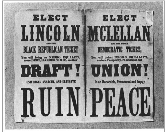
1864: McClellan anti-Lincoln Poster