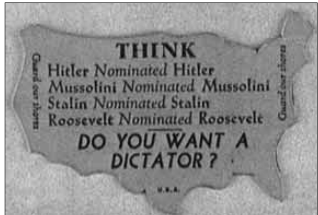
1940: "Do you want a Dictator?" Button