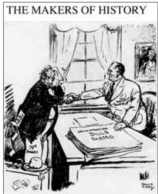
1936: "Makers of History" Cartoon