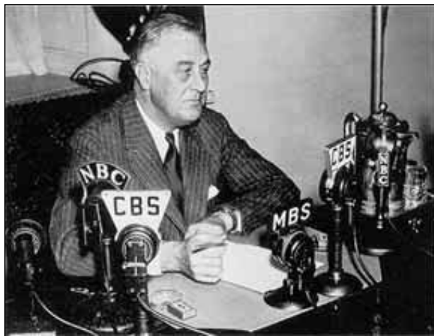
1936: Fireside Chat Photo