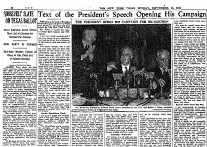
1944: "Fala Speech" in the New York Times