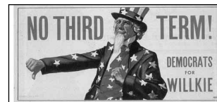
FDR Poster and Willkie Sticker