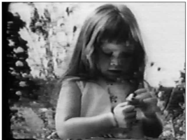
1964: Johnson "Daisy Girl" TV Commercial