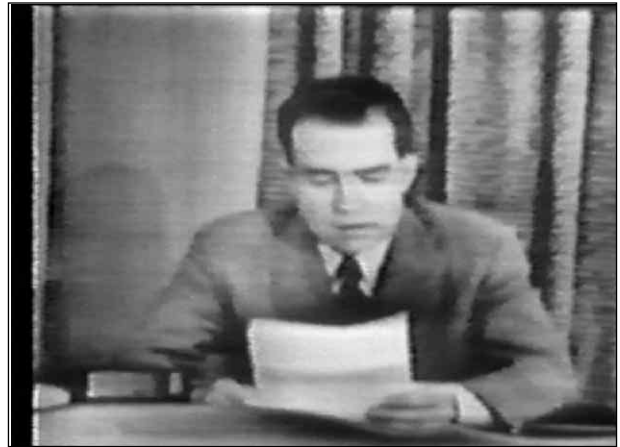
1952: Nixon "Checkers" Speech