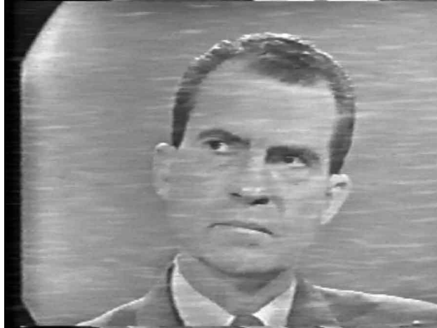
1960: Nixon-Kennedy Debate