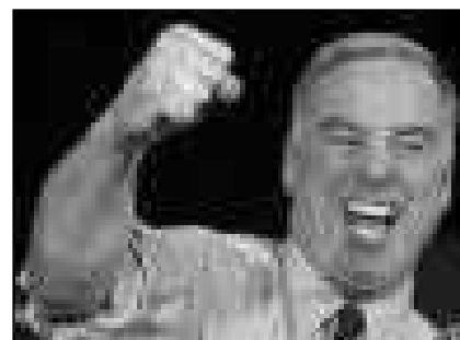
Dean's January 19, 2004 Speech in Iowa