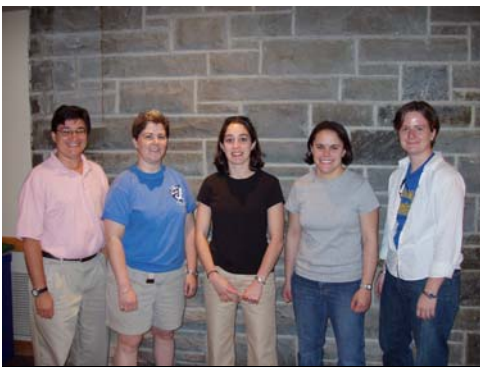
Alumni from 1991 to 2003 gathered for lunch, networking and a history lesson, complete with scrap books and stories from years past.

The following afternoon, current students and alumni gathered for the first-ever LGBTA networking event. Students and alumni found common ground in some of the challenges and opportunities