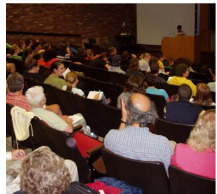
Full house at TransGeneration Screening in August. Before the series premiered on the Sundance Channel in late September, a special festival cut was screened on campus. The Sundance Channel selected Ithaca College as one of 100 campuses to premier the film in a coordinated nationwide sneak-peek screening.