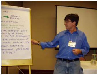
Lis presents a session on cross cultural issues in sexual and reproductive health in the context of the global HIV/AIDS pandemic, at the Creating Change conference in November.