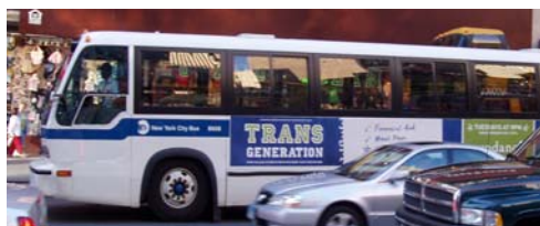
NYC bus advertising TransGeneration