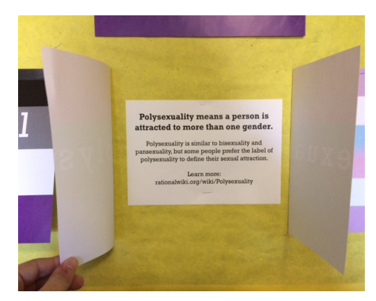
Cut each flag in half, then display the descriptions underneath so residents need to open the flag to learn more.