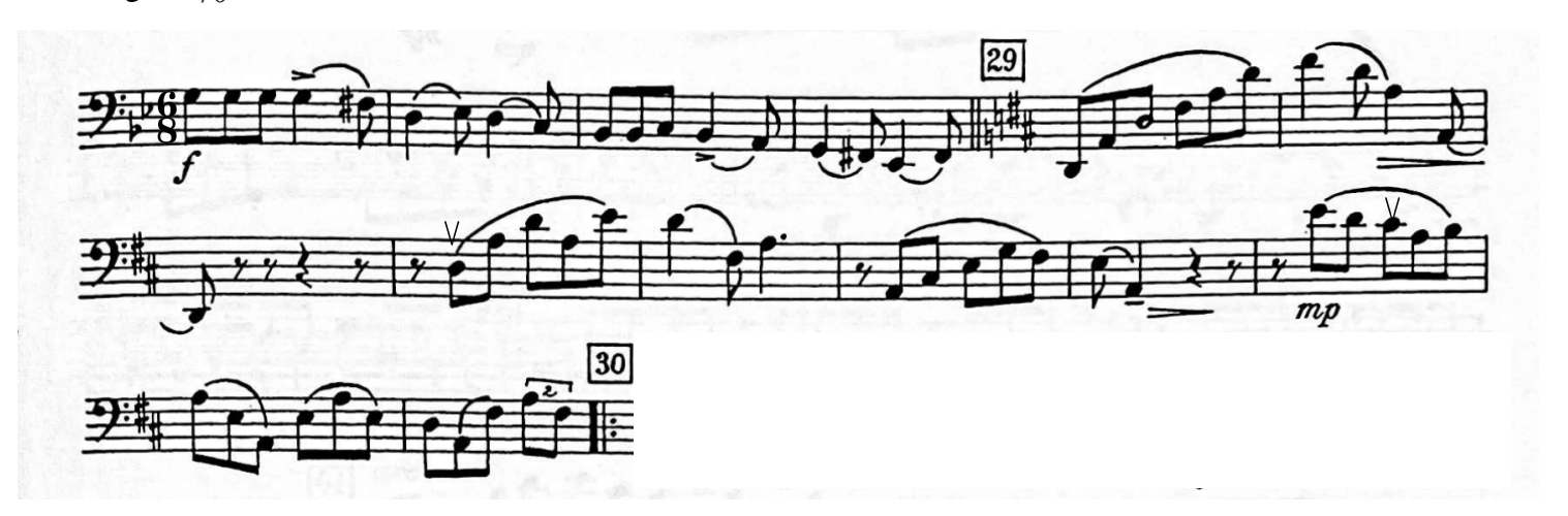
Excerpt 2 Mendelssohn Symphony X- mm.185-201 d = 120