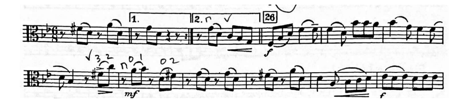
Excerpt 2 Mendelssohn Symphony X- mm.296-314