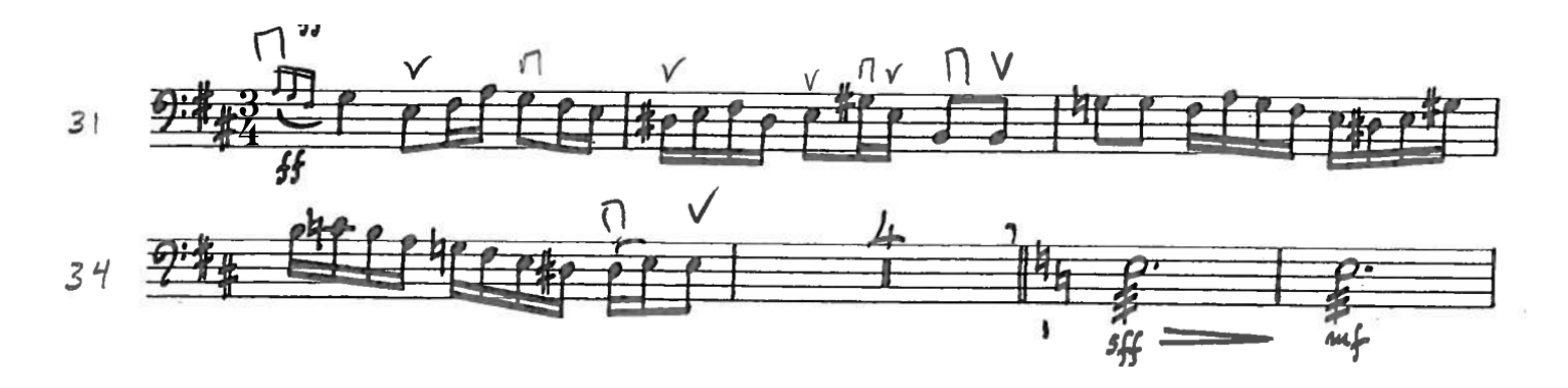
Excerpt 4 Bartok Romanian Folk Dances, mvt. 5- reh. 5 - m.25 Please take special note of the clefs . J= 140