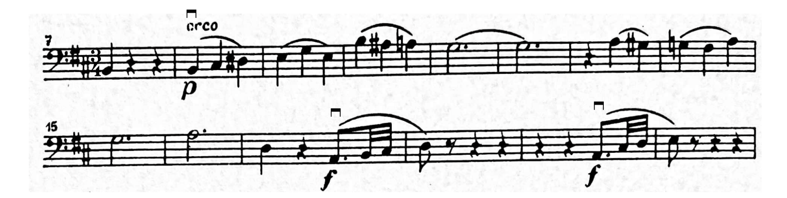
Excerpt 2 Mendelssohn Symphony X- mm.134-147