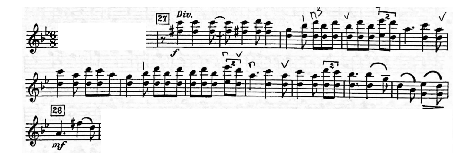
Excerpt 2 Mendelssohn Symphony X- mm. 283-297