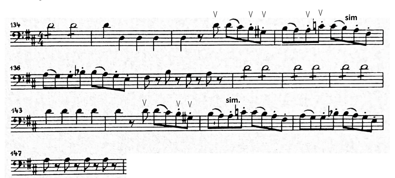
d = 120