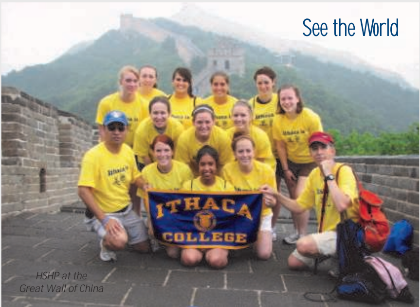
HSHP at the Great Wall of China