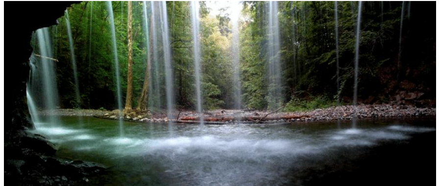
Behind the falls, Great Gully

(bus leaves Textor flagpole circle at 10:30am, space limited reserve a spot early) Join us for a variety of activities at the farm with caretaker Dan Hill (Cayuga Heron Clan). We'll be fencing the tress for winter, working in the apple orchard, and taking a guided hike into Great Gully to pick up trash.